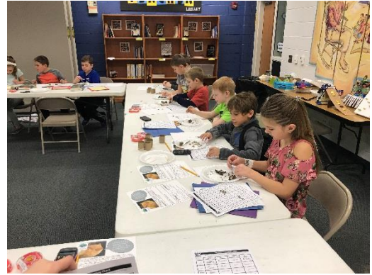
Watershed: "Bats and Owls"

https://www.fortligonier.org/education/raise-the-flag-on-fun/summer-camp/